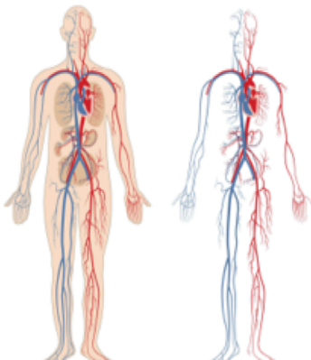
Human circulatory system

In Design Technology we will be investigating and making either a pencil case or mobile phone holder. This will involve looking at existing products, evaluating how they are made and designing our own product. We will cut fabric to accurate measurements and use stitching to secure the fabric.